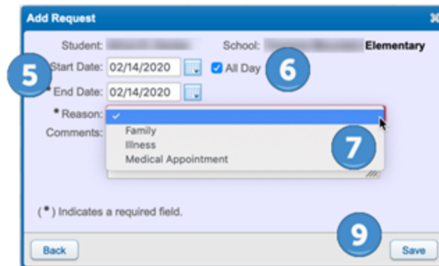
Figure 3. Add a Request