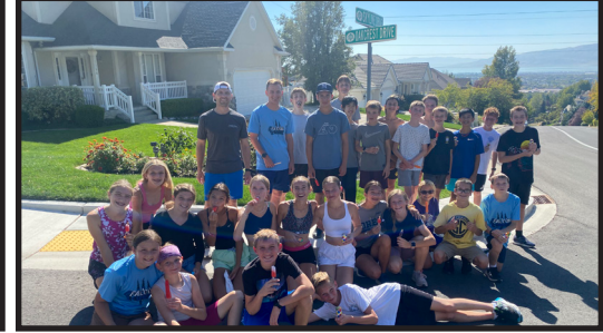
Our cross country team celebrating with a nice cold popscicle after conquering the noto-rious Skyline Drive.

Canyons (9th Grade Field Trip) District Cross Country Championship - Port McCord (8th) Placed 5th Overall - 8th Grade Boys Placed 2nd as a team, - 8th Grade Girls Placed 4th as a team. Choir Concert Fall Break Halloween