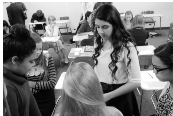
Preparing a resolution at Model United Nations.

Although our results are strong, there are still areas for improvement. One area our teachers are working on improving is reading. All students can benefit from reading books on their level. Our teachers want to help every student improve their understanding of reading and grow to become better readers. Please help by encouraging reading over screen time.