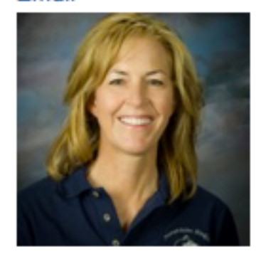
Gi - N