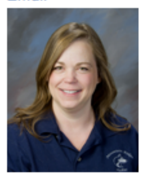
O - Z