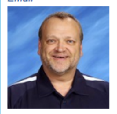
A - Gh