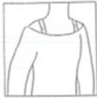
NO DOU (BANDA)